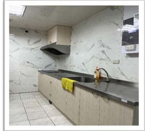
Kitchen & lobby