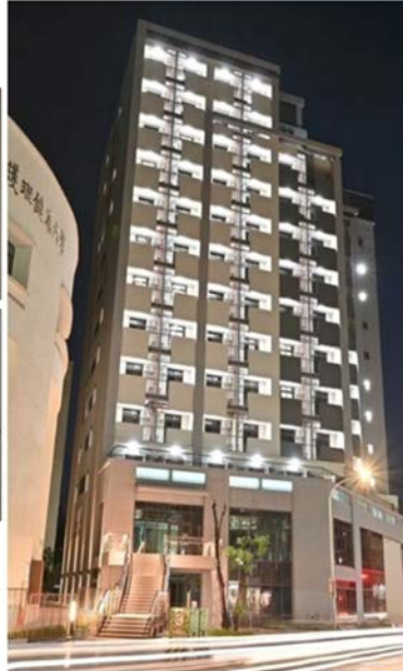
Exterior of the building