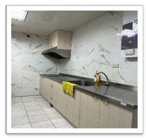
Kitchen & lobby