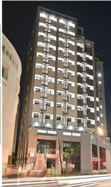
Exterior of the building