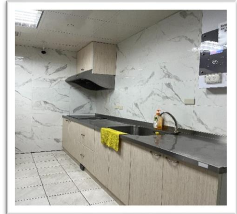
Kitchen & lobby